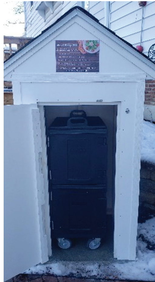
Heated shed keeps food warm.

With winter approaching, the shelter had to figure out how groceries and food drop off could be done due to the COVID precautions. A local contractor, Ken LeCuyer from All Phase Contracting Services, donated the labor and materials for our new "Food Hut". What a spectacular addition to the shelter.