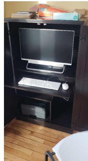
Wireless computer was purchased for the program.