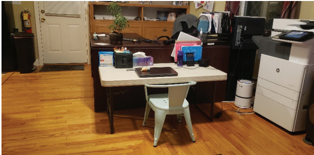
Work station set up for a staff child right by Moms desk

All of the shelter families were heavily affected by the pandemic as was staff members. Staff had to be extra careful when traveling back and forth to their homes and while conducting agency/program business. Two of our three full-time staff members had to juggle their full-time jobs at the shelter, as well as supporting their children's educational needs. We met this challenge head on and in the end made it work.